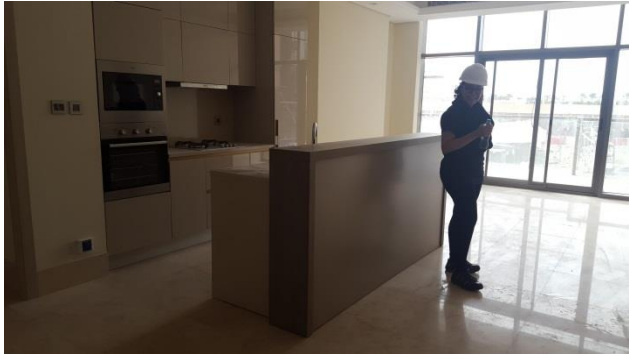
Kitchen / living area – work in progress