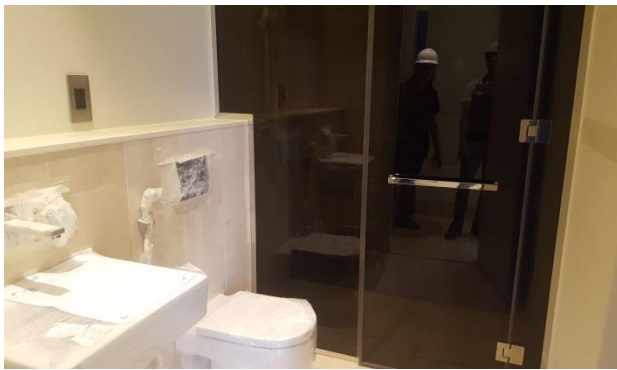
Bathroom – work in progress