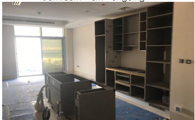
Cabinetry work – ongoing