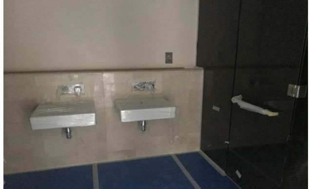
Bathroom work – ongoing