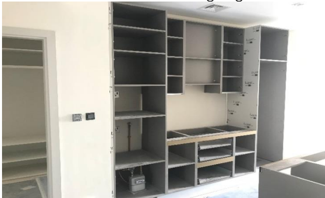
Cabinetry work – ongoing