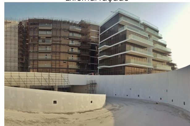
Carpark – entrance