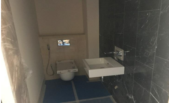
Bathroom work – ongoing