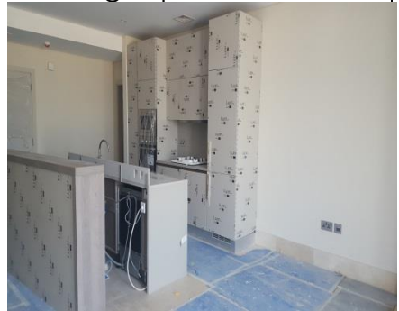
Finishing & protection