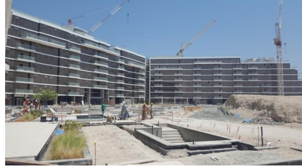
External common area – ongoing finishing work