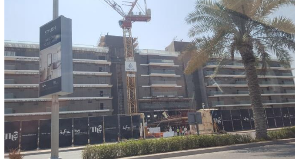
Gulf facing view – Block B reception & hording