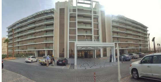
Block B Main entrance