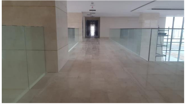
Block B – finished corridor