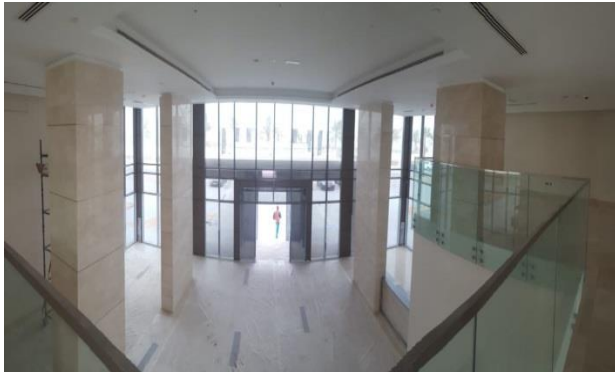
Block B entrance – view from 1st floor