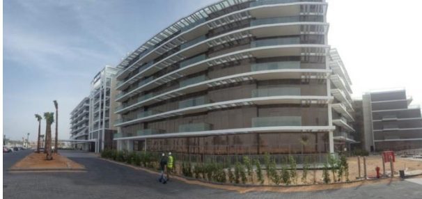
Block A side elevation